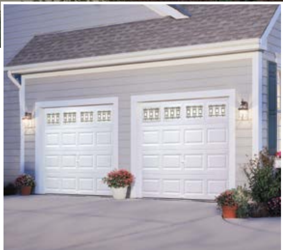
Model T41S, Short Traditional Panel with Optional Short Trenton® Window Design