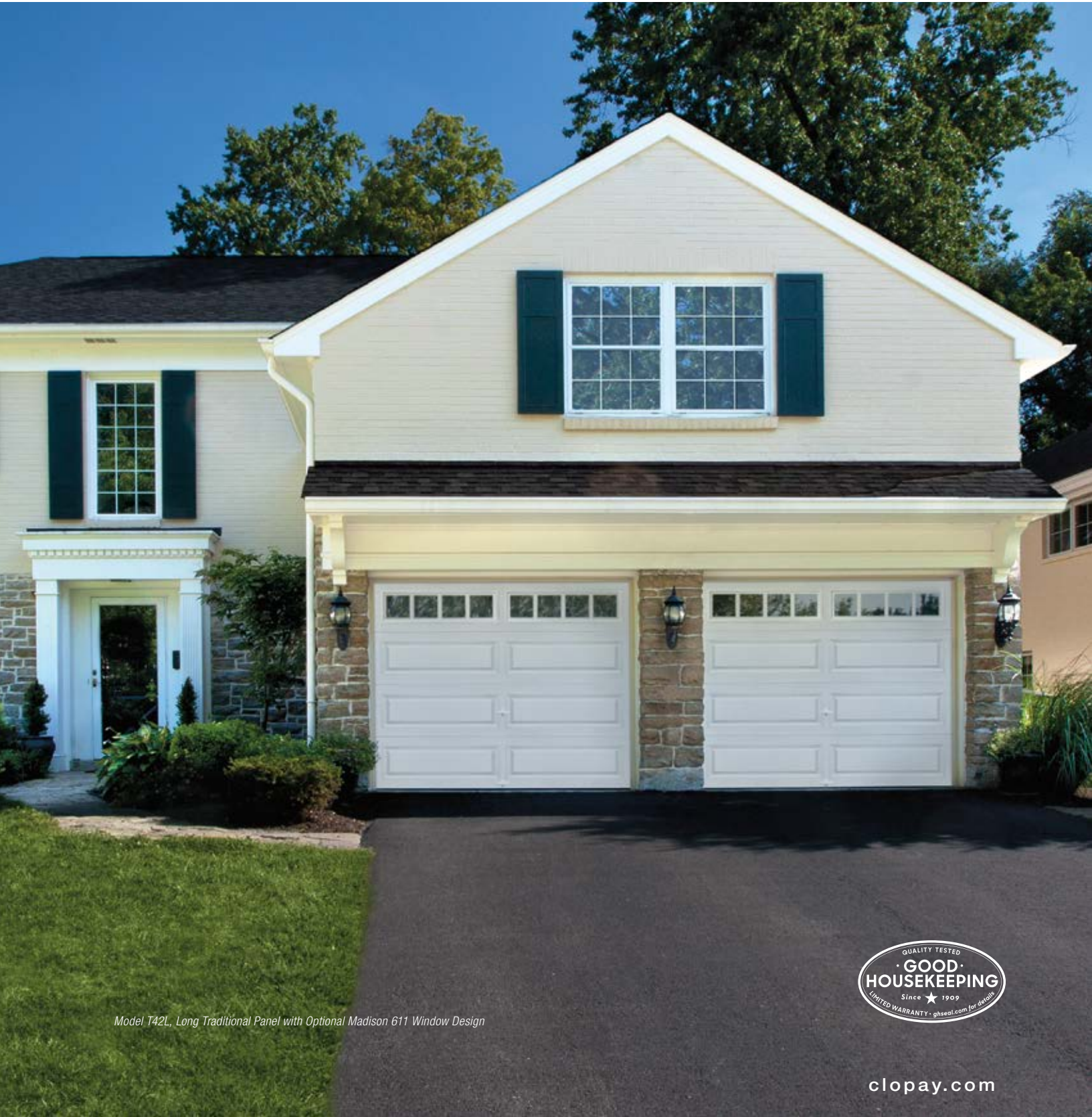
Model T42L, Long Traditional Panel with Optional Madison 611 Window Design